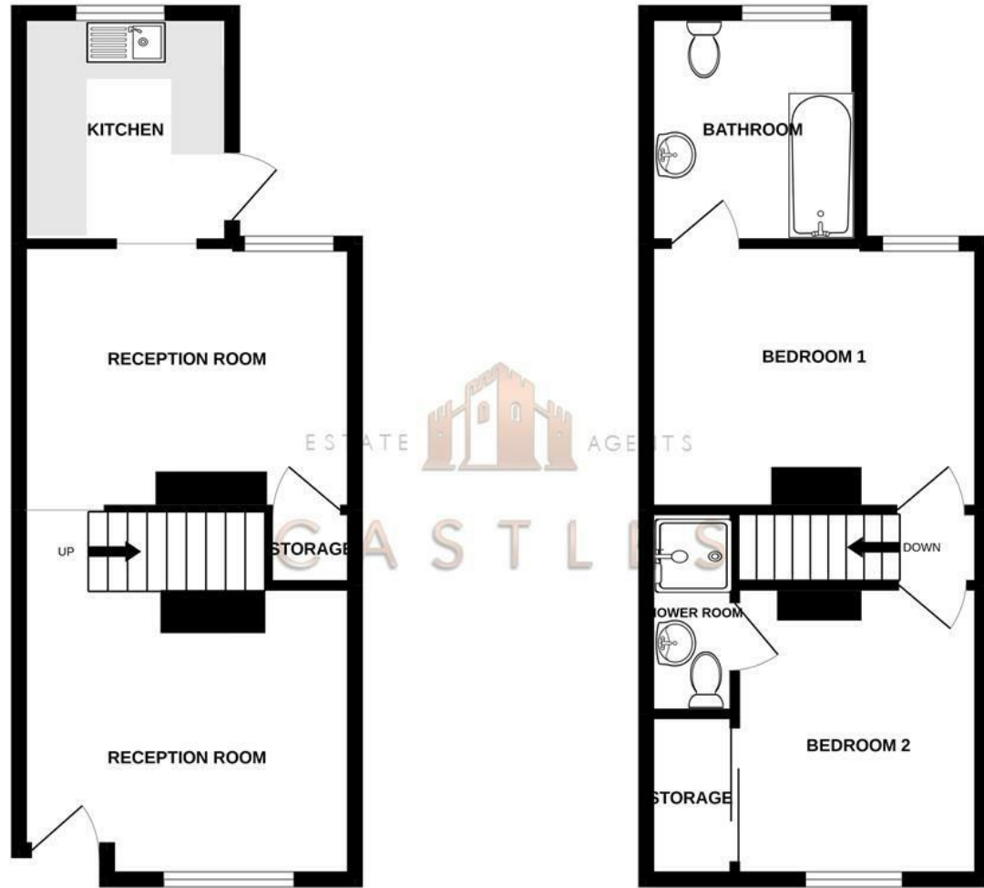
1ST FLOOR 354 sq.ft. (32.9 sq.m.) approx.

TOTAL FLOOR AREA: 701 sq.ft. (65.1 sq.m.) approx. Whilst every attempt has been made to ensure the accuracy of the floorplan contained here, measurements of doors, windows, rooms and any other items are approximate and no responsibility is taken for any error, omission or mis-statement. This plan is for illustrative purposes only and should be used as such by any prospective purchaser. The services, systems and appliances shown have not been tested and no guarantee, as to their operability or efficiency can be given. Made with Metropix ©2022